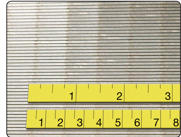
Parabolic Filtration Screen