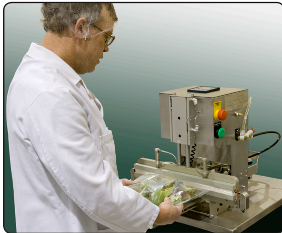
Loading bags is easy with the AVSealer

The AVSealer packaging and sealing machine has a programmable range of vacuum pressures and temperatures for consistent sealing of a wide range of products including wet or dry lettuces, cut vegetables, fruit, fresh herbs and other small produce.