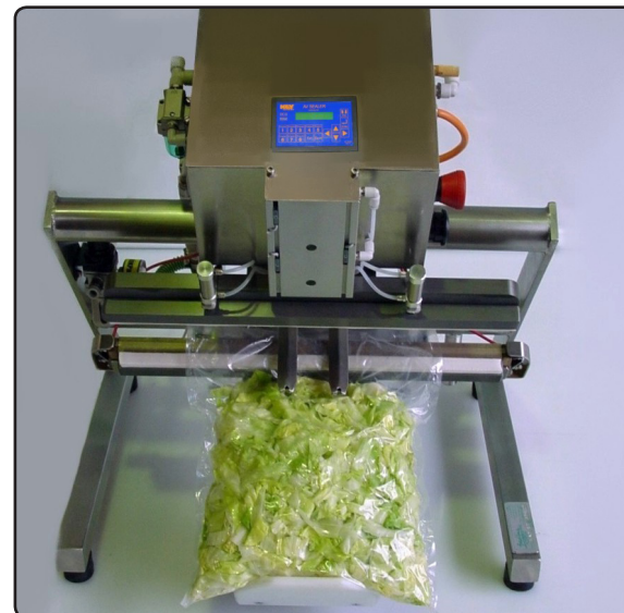
AVSealer on bench stand

Call Key for price and delivery information or order online at www.key.net .