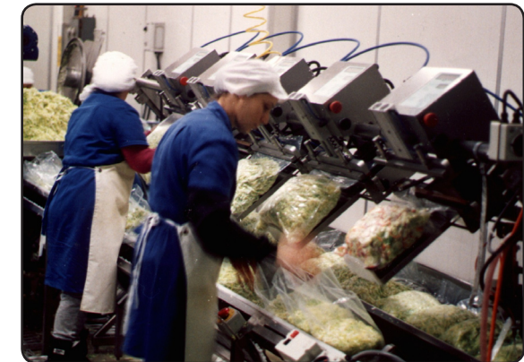
AVSealer system on flexible rack-mounted floor stand system

Key Technology BV Beijerdstraat 10, 4112 NE Beusichem, The Netherlands Phone: +31 0 345-50 9900 • Fax: +31 0 345-50 1594 • keybv@key.net • www.key.net