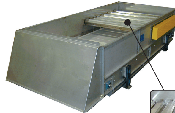
Star Roller Conveyor

If you process tobacco, let Key help. You will get the job done with no surprises, no hassles. And you will go home each day proud of your quality – and your bottom line!