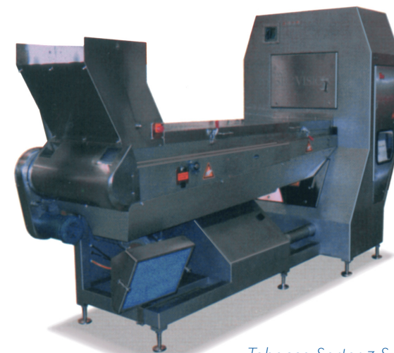
Tobacco Sorter 3 System

Operation is simple, and sorting criteria are easy to adjust, store, and retrieve, so sorting is stable and objective.