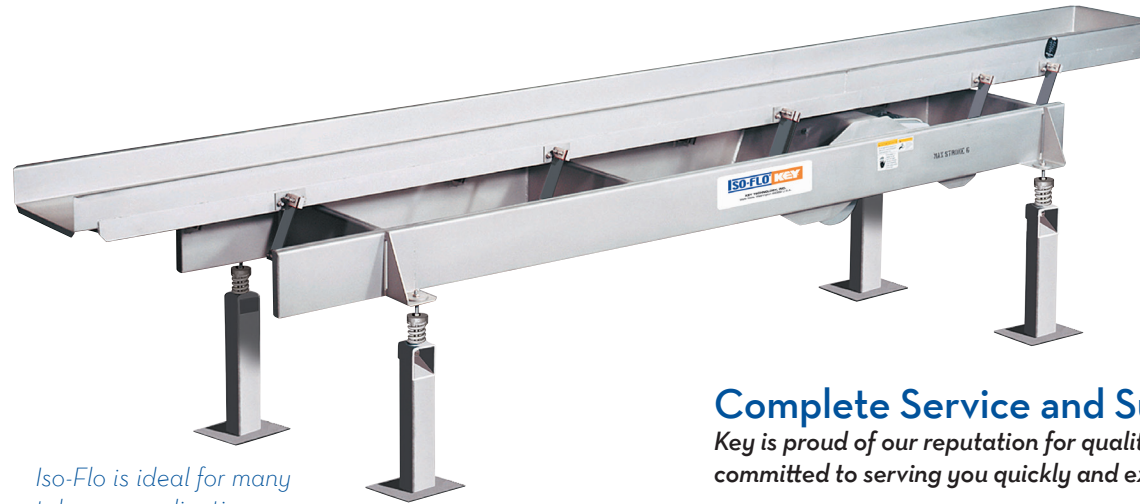
Iso-Flo is ideal for many tobacco applications