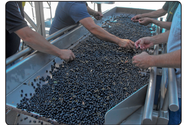
Post De-stemmer Sorting Table